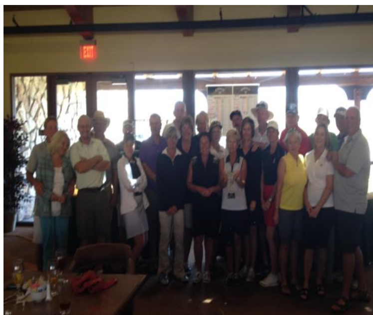
Sun City team showing off team trophy after defeating Oasis