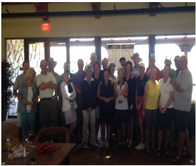
Sun City team showing off team trophy after defeating Oasis